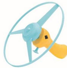
Zoom Flying Disk

For every deposit made at school students will receive a silver Dollarmites token. Once students have individually collected 10 tokens they can redeem them for exclusive School Banking reward items in recognition of their regular savings habits. There are two new items released each term so be sure to keep an eye out for them!