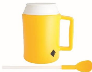
Slushie Maker Cup

Exciting new Term 4 rewards with a Super Savers theme are now available while stocks last!